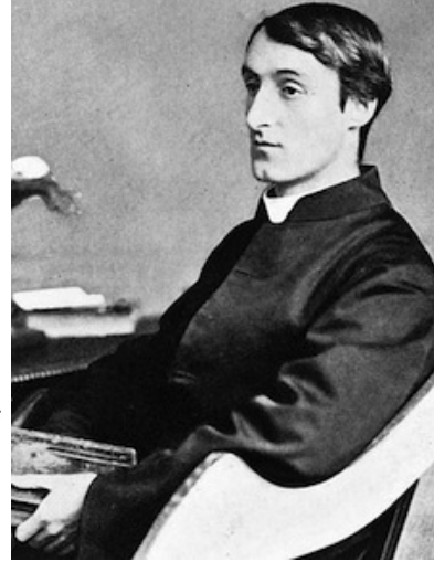
Rev. Gerard Manley Hopkins, SJ